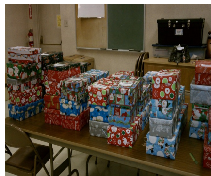
table in the social room! We are going to be discussing that and decide whether or not we want to increase our goal this year, since we have such a fine start. I will report on that decision and on our schedule for the overall project, in the next edition of The Voice newsletter.

As you continue your shopping for back to school this year, don't forget to look for bargains that can be used to fill our shoe boxes in the next several months. Items like pencils, tablets, notebooks, crayons and markers are all available at discount prices right now. We will begin to collect these items at church in October, which of course, will be here before we know it! The good news is we already have 64 shoe boxes under the