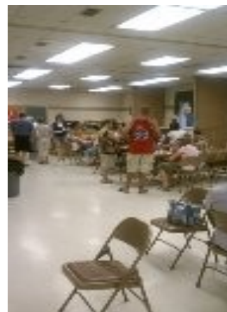
Young people are making their own puppets after the puppet show on July 24. They are also enjoying some ice cream and other snacks!

I will resume scheduling people for teaching the children's rotation workshops and sponsoring the Circle Time refreshments & devotions. If you'd like to get involved in teaching, Circle Time, refreshments and/or youth events, please see me at church. We always welcome & encourage people to get involved.